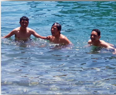
Hot enough for a swim!